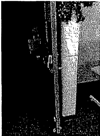
Ojibwa Classroom Door Hardware